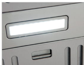
1.5W LED LIGHTS

The motor in the ERB120BK has been designed to provide maximum extraction with minimum noise.